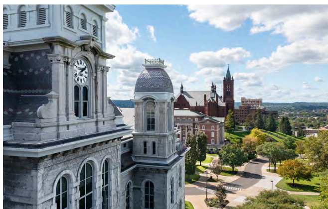
Syracuse University Hall of Languages.

Voluntarily dropping courses: Students who voluntarily drop courses before the semester's posted drop date deadlines are eligible for a 100 percent refund of the tuition paid. Students who withdraw (WD) from the course after the drop deadline remain financially responsible to the University.