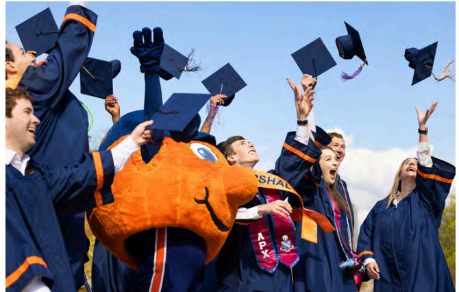
Graduates celebrating with Otto.

Associate Director for Research and Evaluation Syracuse University Project Advance 400 Ostrom Avenue Syracuse NY 13244-3250 E-mail: supa-evaluations@syr.edu