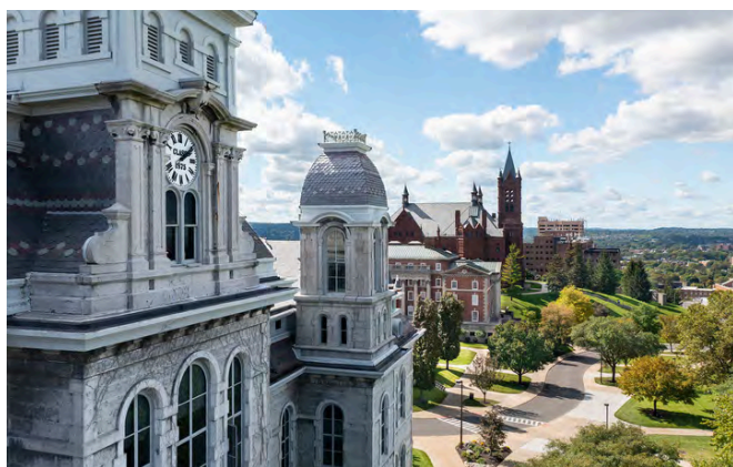
Syracuse University Hall of Languages.

If you are unable to receive any form of recognition for your Syracuse University course(s) taken through SUPA, remember that the experience was not wasted. First of all, that credit and the educational experience are always yours. If for some reason you transfer to a different school, you may be able to transfer the credit to that institution. Also, the academic skills you developed during the courses will likely help you be more successful when you attend college. If you ever leave college for some reason, the work you completed at SU will always be there for you. Whatever your situation, the coursework you took from Syracuse University will serve you well throughout your life.