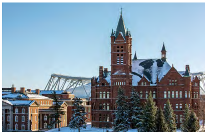
Syracuse University campus buildings during the winter.

Syracuse University reserves the right to enact an administrative drop for students who are absent from class for an extended period of time and cannot meet the participation requirements of a course for reasons other than a documented disability, e.g., for a school suspension.